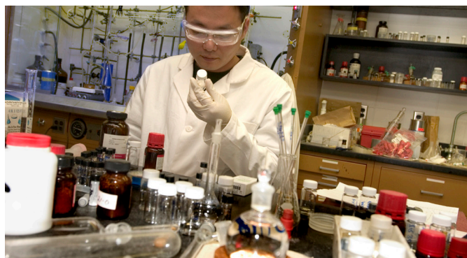
U of M Duluth's Swenson College of Science and Engineering aims to add 370 additional students to its STEM programs over the next five years.