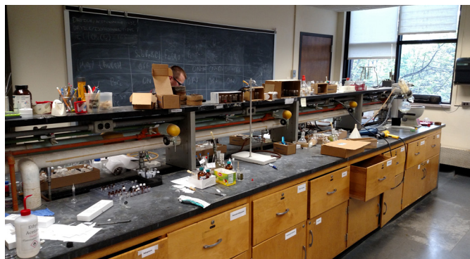
Constrained bench space and restricted sightlines between instructors and students in current chemistry lab spaces limit learning opportunities.