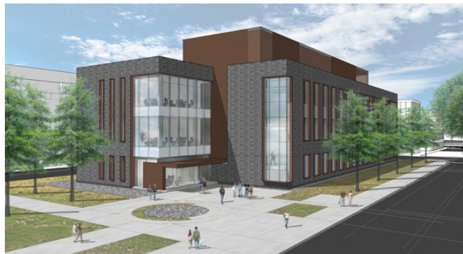
In 2014, the legislature invested $1.5 in predesign and design of the Chemistry and Advanced Materials Science Building.