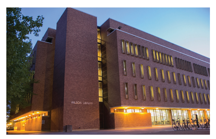
Renovation of Wilson Library, built in 1968, will revitalize library services, and enhance learning and scholarship.