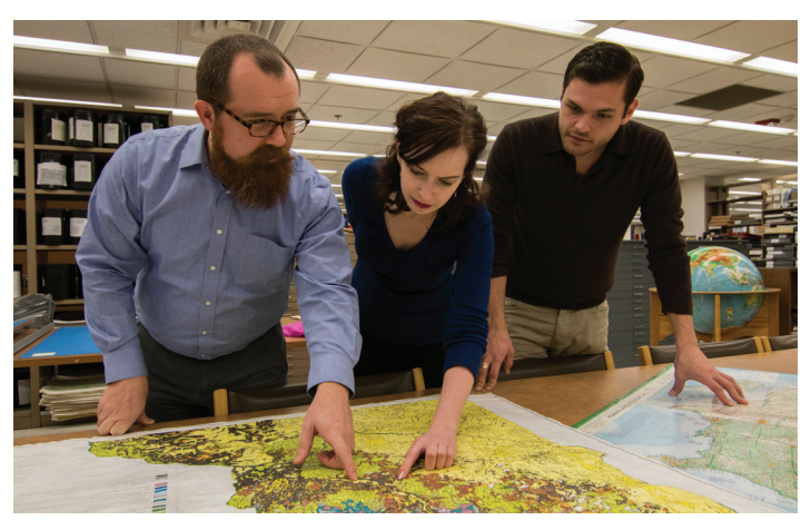
Library experts collaborate with students and faculty on research and teaching.