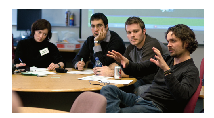
At the U, students are educated to think critically across global perspectives.