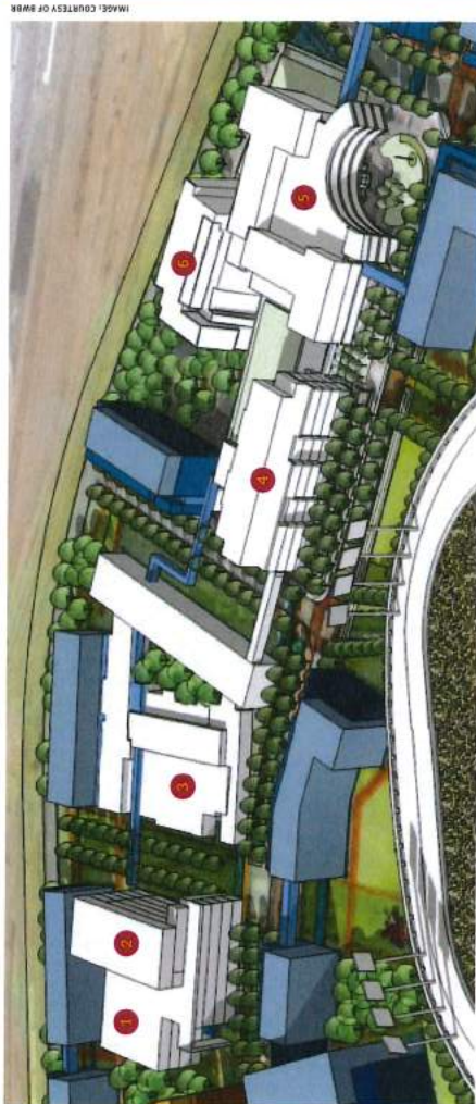
By clustering and interconnecting all buildings in the Biomedical Discovery District—including the 80,000-square-foot Microbiology Research Facility (6), now under construction—the University is maximizing resources and fostering collaboration among disciplines.

A groundbreaking idea can come from anywhere—from silence, from a brainstorm, from a chance encounter with someone new. That's why the Biomedical Discovery District purposefully incorporates flexible, open laboratory spaces and common areas for those who work there: to make collaboration easier. By sharing knowledge and building one another's discoveries, basic science researchers and clinicians working side by side here can find new treatments for some of today's most challenging and complex health conditions, faster than ever before.